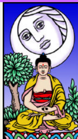
The Buddha Tarot