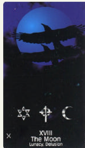
Crow's Magic Tarot

penetrate its mysteries, we gain awareness and greater freedom. Truly our mind can cross the barriers of time and space to show us fascinating glimpses of the past, present or future. It can help