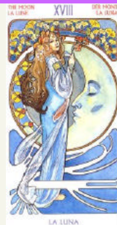
Tarot Art Nouveau